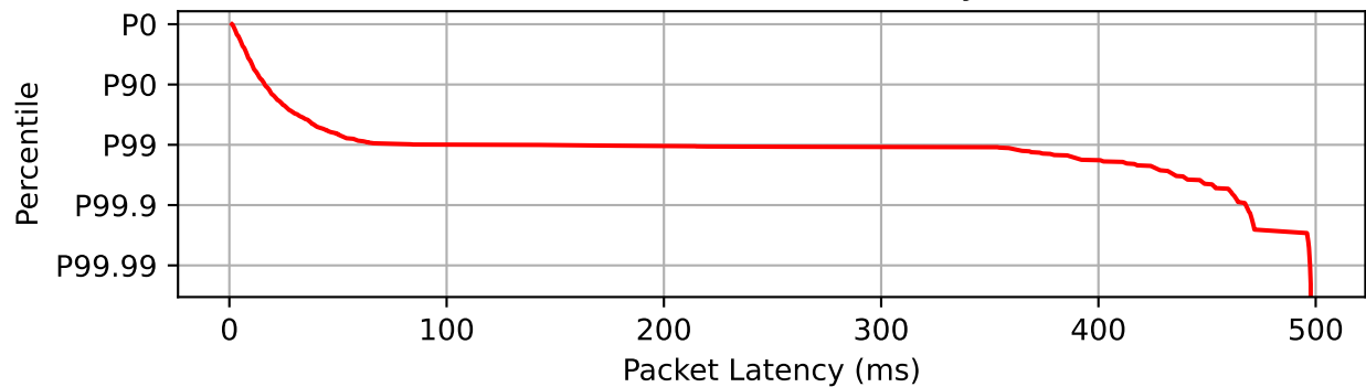
CCDF of Packet Latency